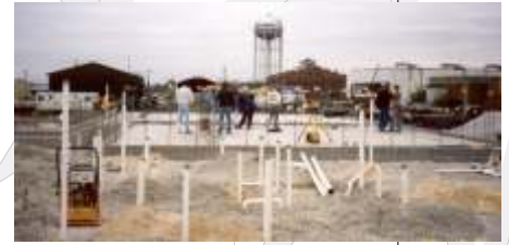
Underslab Exelectrical & Plumbing Systems