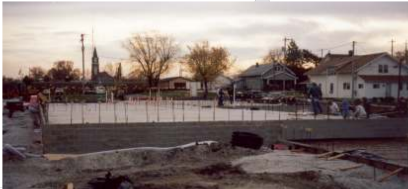
Basic Slab Prior to Reinforced Walls