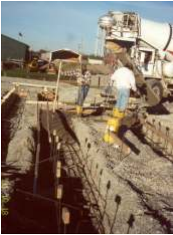
Foundation Concrete Pour