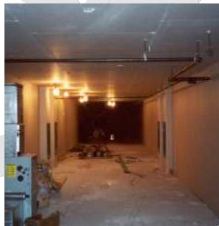
2nd Floor Storage Drywall Installation