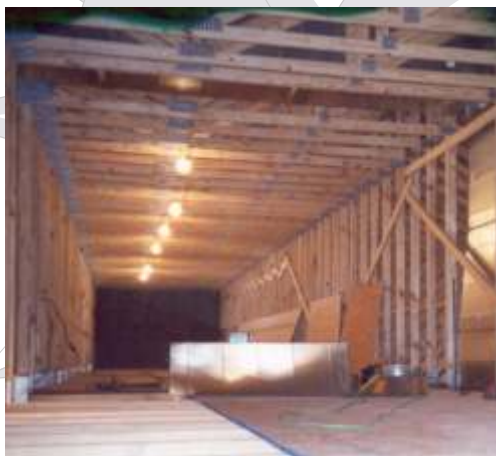
2nd Floor Storage “Box-Out” Type Trusses